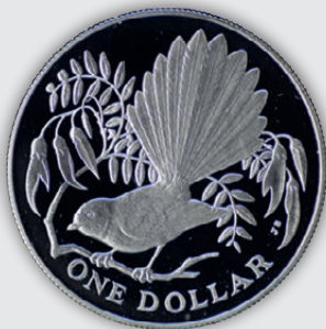
Lot 383 Pattern NZ Dollar 1982 with Fantail Estimate $3000