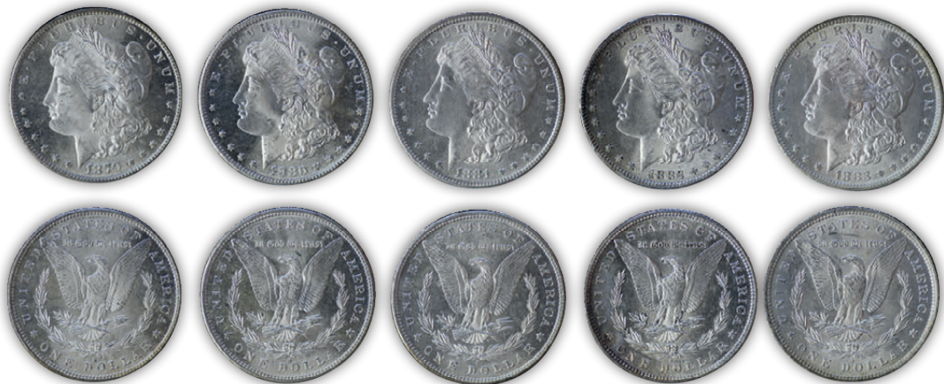
Lot 100 Reduced