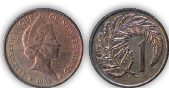
Lot 384 Enlarged