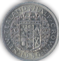
Lot 348 Reduced