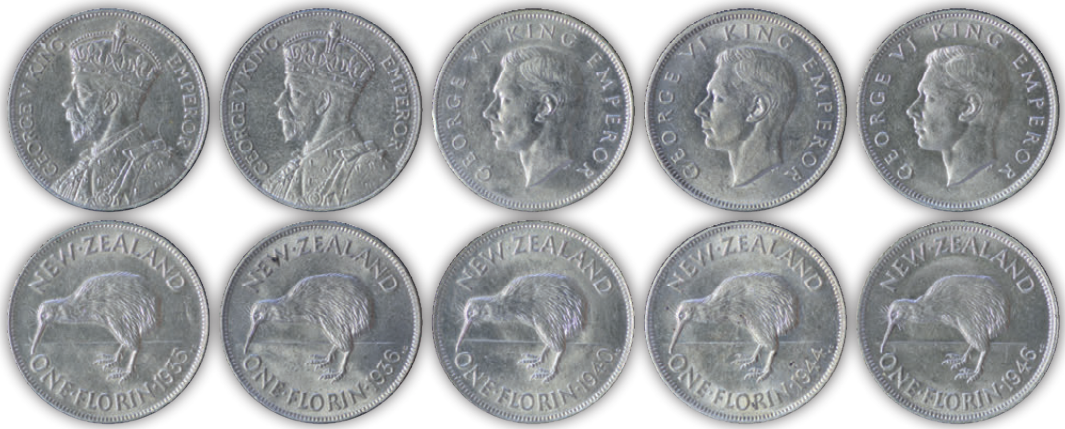
Lot 353 Reduced