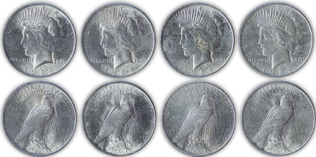
Lot 106 Reduced