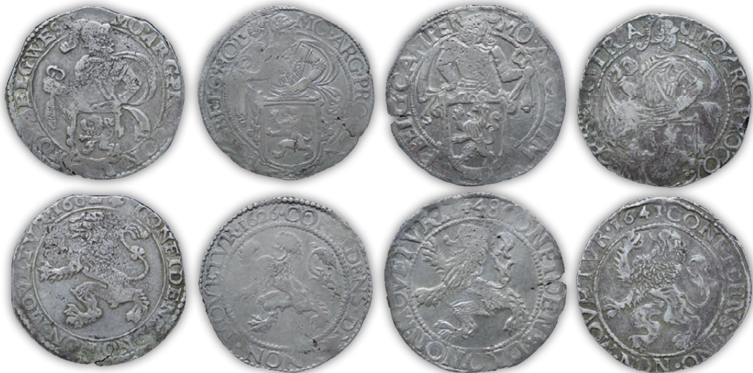
Lot 83 Reduced