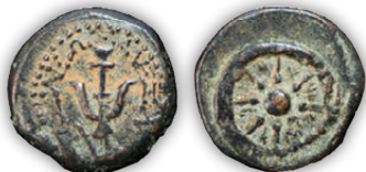
Lot 122 Enlarged