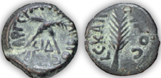
Lot 124 Enlarged