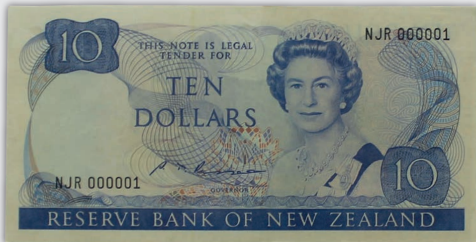
Lot 558 The First Note of Sir Spencer Russell Estimate $15,000