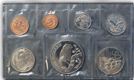
Lot 388 Reduced