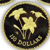
Lot 326 Reduced