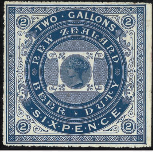
2088 - image reduced in size