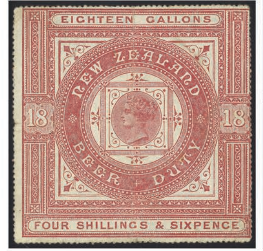
2075 - image reduced in size