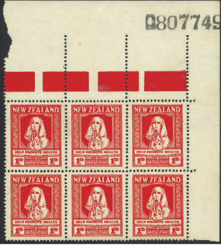
1363 - image reduced in size