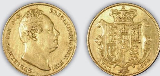
Lot 361 William IV Sovereign