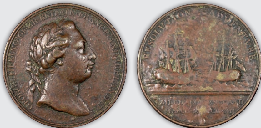
Lot 4 Resolution and Adventure Medal