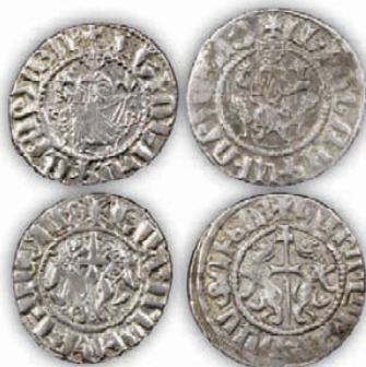
Lot 7 Part Lot, one of five.