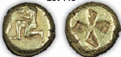
Lot 119 (200%)