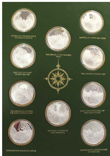
Lot 57 Part Lot Reduced