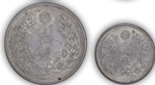
Lot 168 Reduced actual height 320mm