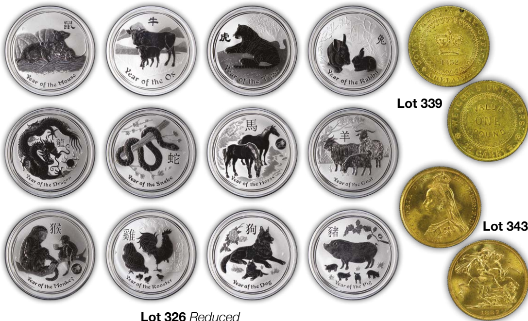
Lot 326 Reduced