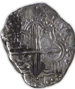
Lot 119 Part Lot