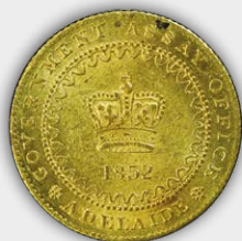
Lot 339 Est $16,000