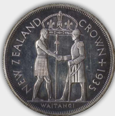
Lot 375 Est $10,000