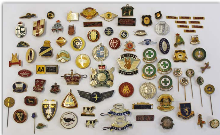
Lot 460 Part Lot Reduced