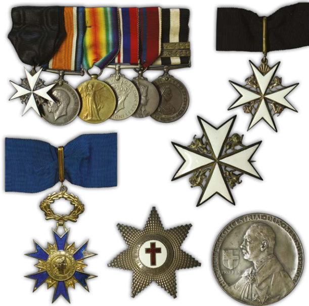
Lot 39 Reduced