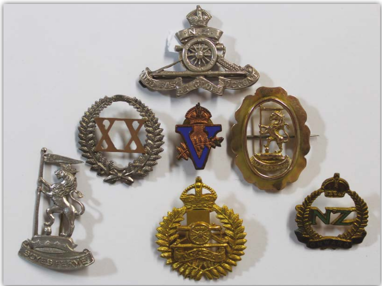
Lot 101 Reduced