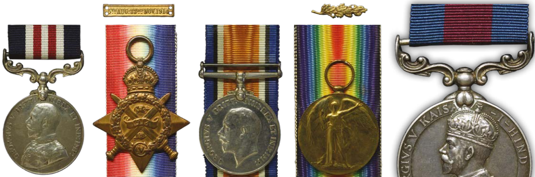
Lot 34 Reduced