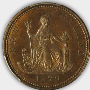
Lot 354 Est $5,500