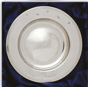
Lot 459 Reduced