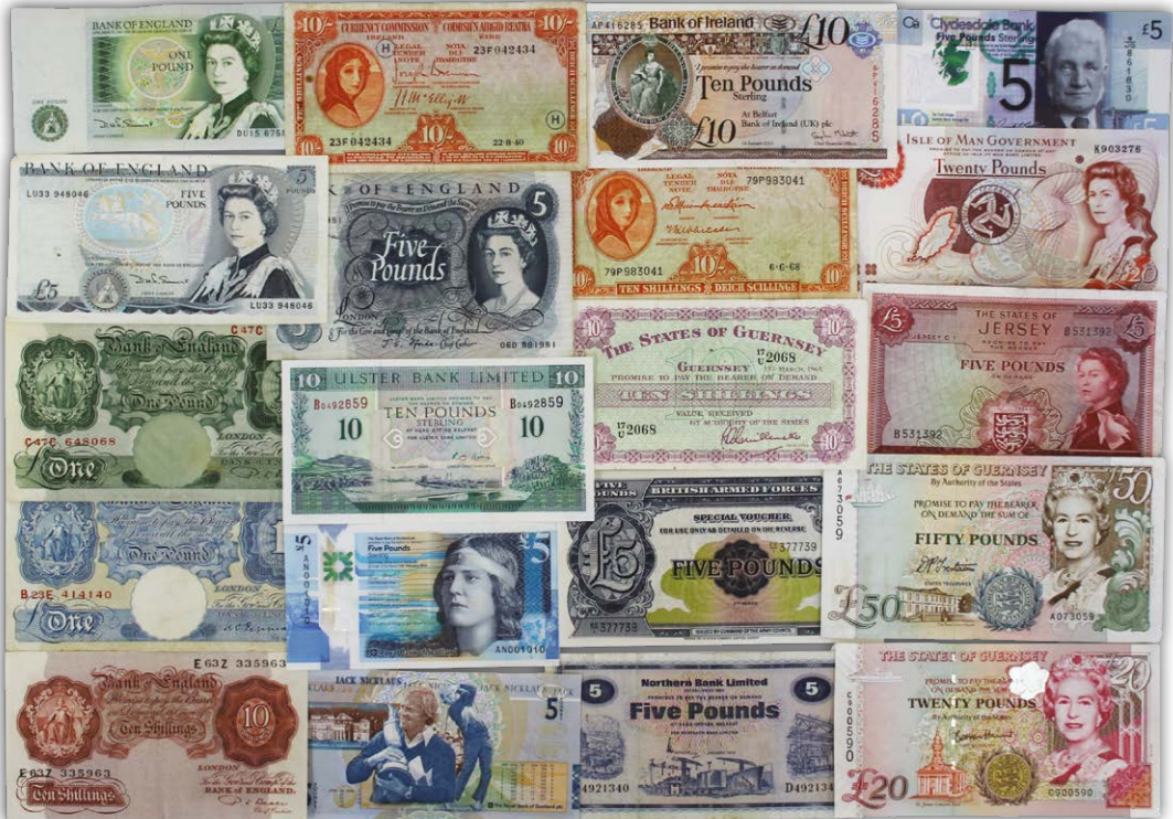
Lot 467 Part Lot