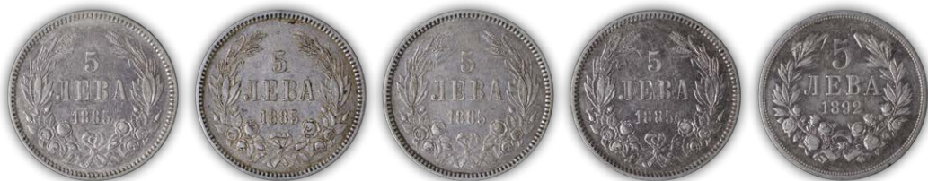
Lot 120 Part Lot Reduced