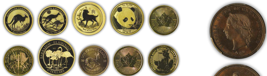
Lot 352 Reduced