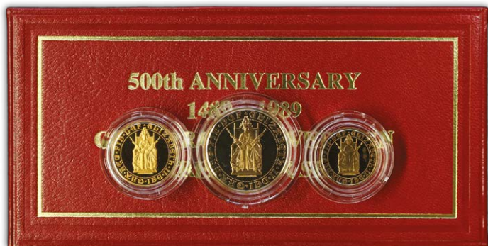
Lot 289 Reduced