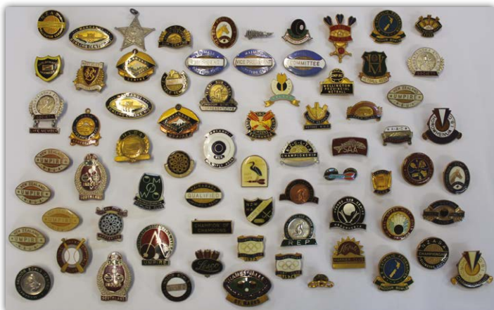
Lot 461 Part Lot Reduced