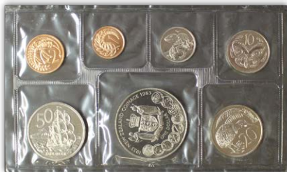
Lot 427 Reduced