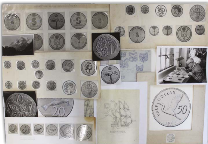
Lot 452 Part Lot Reduced