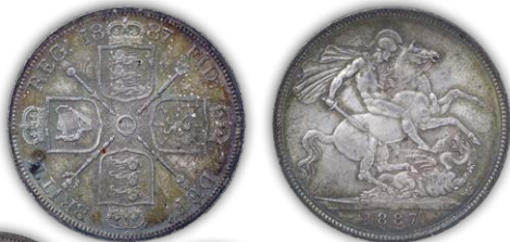
Lot 288 Reduced