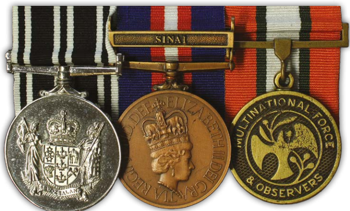
Lot 14 Reduced