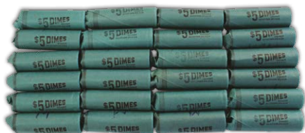
Lot 192 Reduced