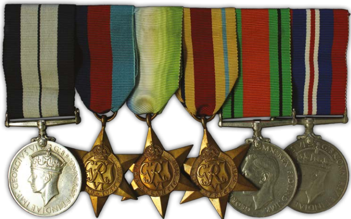
Lot 42 Reduced