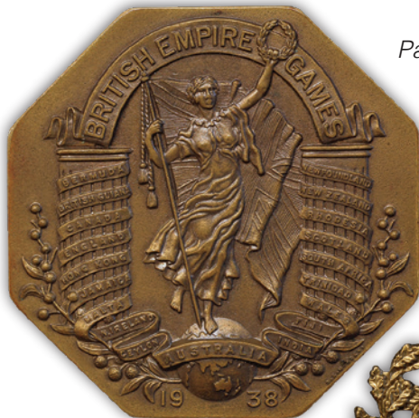
Lot 100 Part Lot Reduced