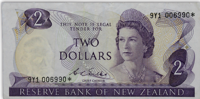
Lot 556 Wilks $2 Star Replacement 9Y1*. VF Est $6,000