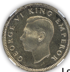
Lot 384 Enlarged