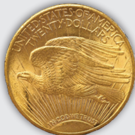
Lot 267 USA $20 1924. AU Est $6,000