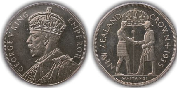
Lot 382 Proof Waitangi Crown 1935. PCGS PR66 Est $17,000