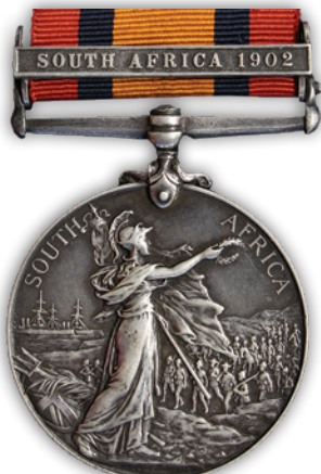
Lot 13 Part Lot