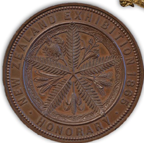
Lot 115 Reduced