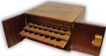
Lot 481 Part Lot Reduced