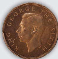
Lot 388 NZ Proof Halfpenny 1949 Est $3,000