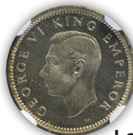
Lot 385 Enlarged