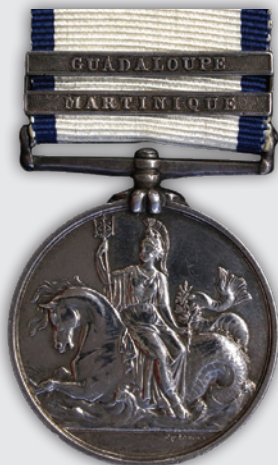
Lot 35 GB Naval General Service Medal 1793-1840 Est $3,000