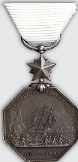
Lot 45 GB Arctic Medal 1818-1855 Est $3,000