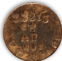
Lot 108 Reduced