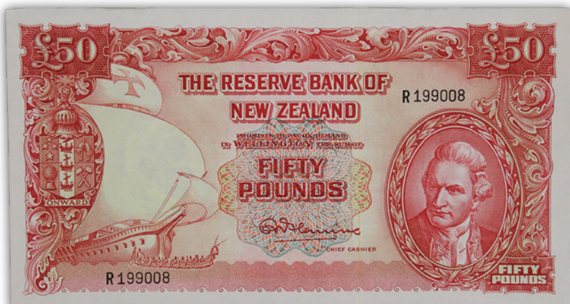
Lot 529 Fleming Fifty Pounds. AU Est $5,000