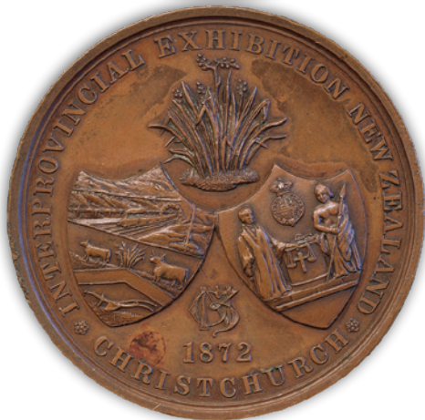
Lot 116 Reduced