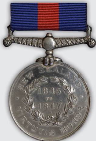
Lot 1 NZ Medal 1845-1847 Est $3,000