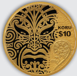
Lot 458 NZ $10 2013, Koru. PROOF Est $5,500