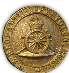
Lot 132 Reduced