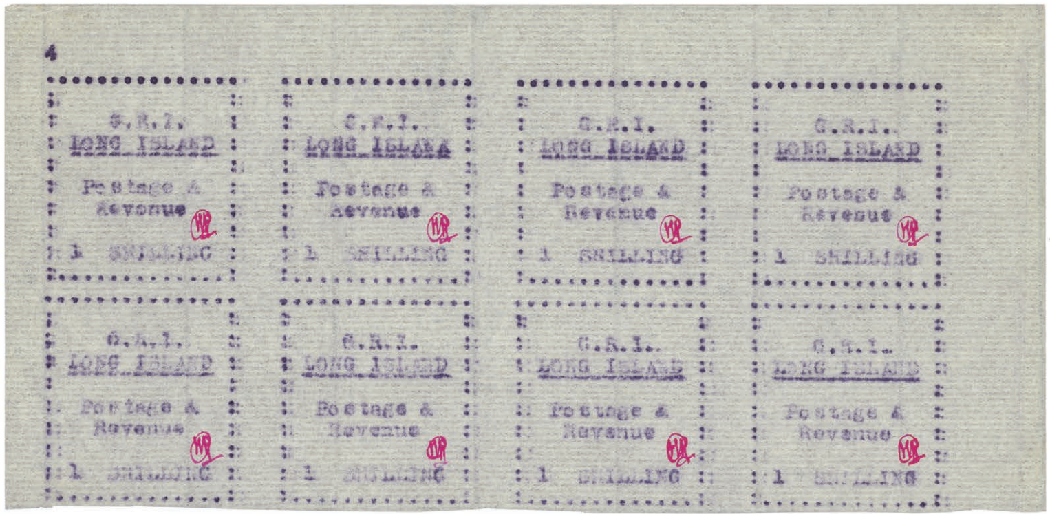
1072 (image reduced)