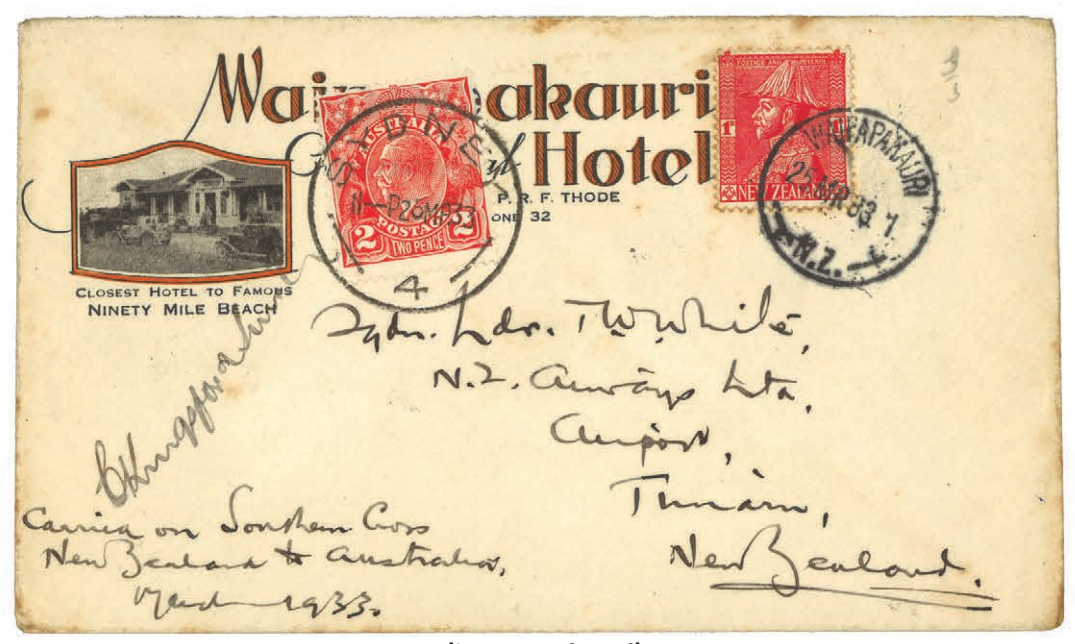
932 (image reduced)