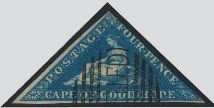
LOT 995 PERKINS BACON CANCEL SG6A CAT £20000 ONLY 3 KNOWN