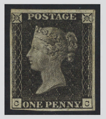
LOT 886 1d BLACK UNUSED CAT £20000+ SG SPEC AS25