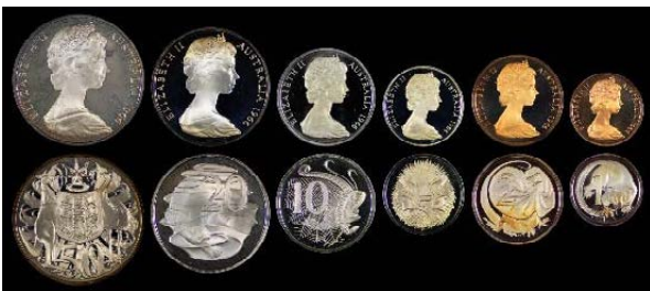
Lot 246, Australia, PROOF SET, with blue RAM case, Reserve $140