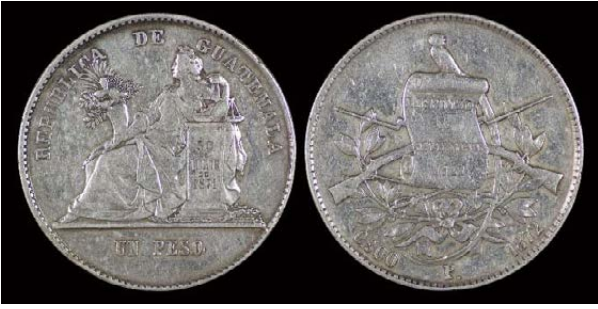
Lot 57, Guatemala Peso, 1872P, VF Reserve $140