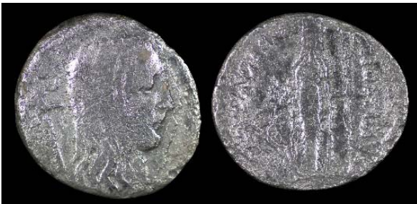
Lot 124, Roman, Denarius 48BC, celebrating Julius Caesar's victories in Gaul, with Gallic Goddess and captive, VG. Reserve $140