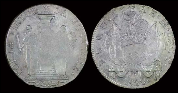
Lot 78, Peru 8 Reales 1824 JP, counterstruck on 1822 coin, scarce, AU, Reserve $1400