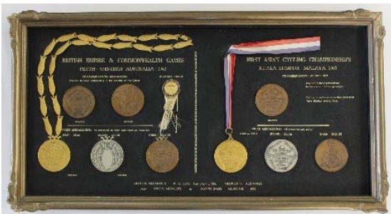
Lot 378, Commonwealth Games Medals 1962 on display board, by KG Luke, Medallists to the Games. Reserve $420