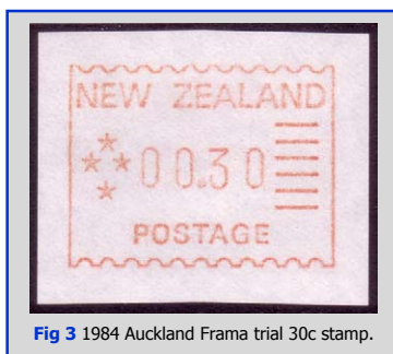
Fig 3 1984 Auckland Frama trial 30c stamp.

The trial was aborted earlier than intended because of the philatelic use of the machine rather than the intended public use. That a trade colleague essentially sat outside the Auckland GPO feeding the Frama machine for the duration of the trial is beside the point. With only one machine in NZ and a huge overseas demand was there any wonder that the trial was a New Zealand Post Office fiasco?