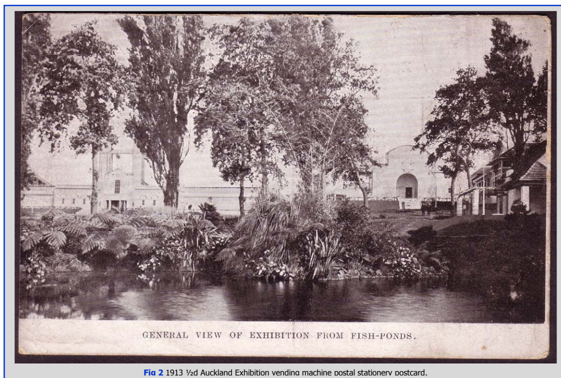
Fig 2 1913 ½d Auckland Exhibition vending machine postal stationery postcard.

Also, at the Auckland Exhibition were several post card vending machines. These were not any old postcards but postal stationery post cards! Contemporary messages written on some of these postcards indicate that they were bought (two for a penny!) from a coin in the slot machine. This meant that the postcard itself was free. Ah, those were the days – something for nothing! The postcards depicted various scenes and were issued with either a ½d or a 1d denomination. Only 41,400 of the ½d were printed and 20,980 of the 1d. Remainders were destroyed after the close of the exhibition. Some 20 different Auckland views are known and have been reported printed in three different colours on both denomination postcards. Any of the Auckland Exhibition postal stationery postcards in fine condition today is going to cost around $500.