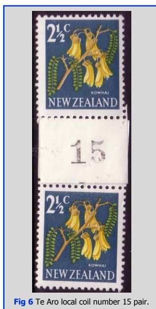
Fig 6 Te Aro local coil number 15 pair.

Three different Postafix stamps were issued in 1977 and 1978. At the time of their introduction New Zealand enjoyed a sealed letter rate of 8 cents and an unsealed printed matter rate of 7 cents. The Postafix stamps were issued in rolls of 400 stamps and were required because of the importation of small stamp dispensers capable of not only dispensing a single stamp but also wetting the adhesive prior to placing it on the envelope. Postafix hand held machines were aimed at the small to medium sized businesses that were unable to benefit from bulk mailing discounts. The time saving device from memory cost something around $30.00.