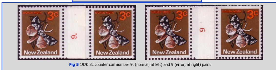
Fig 5 1970 3c counter coil number 9. (normal, at left) and 9 (error, at right) pairs.

Counter coil number pairs are very collectable and range in price from a few dollars each to some costing $1000 or more! At a recent Mowbrays auction in Wellington an 8d Tuatara coil number pair sold for in excess of NZ$3000 by the time the buyer's premium etc. was included! Before moving away from these, it must be remembered that counter coil numbers may be found on a range of definitive stamps for some 40 years, terminating with the unwatermarked 1970 pictorials (released thus from 1973) and that coil number pairs with both watermarks are quite tough to acquire.