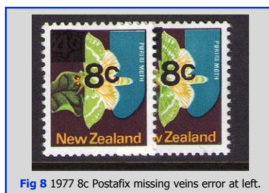
Fig 8 1977 8c Postafix missing veins error at left.

The most common missing colour error of the 1970 pictorials occurred on the 4c Puriri Moth, viz., missing dark green (veins). However, a very few sheets (of 200 stamps) of the 4c missing veins were surcharged 8c and made up into Postafix rolls. These are very scarce and at a first glance nothing appears amiss. Check your 8c Postafix stamps now!