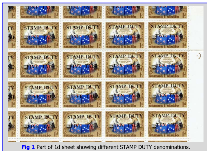
Fig 1 Part of 1d sheet showing different STAMP DUTY denominations.